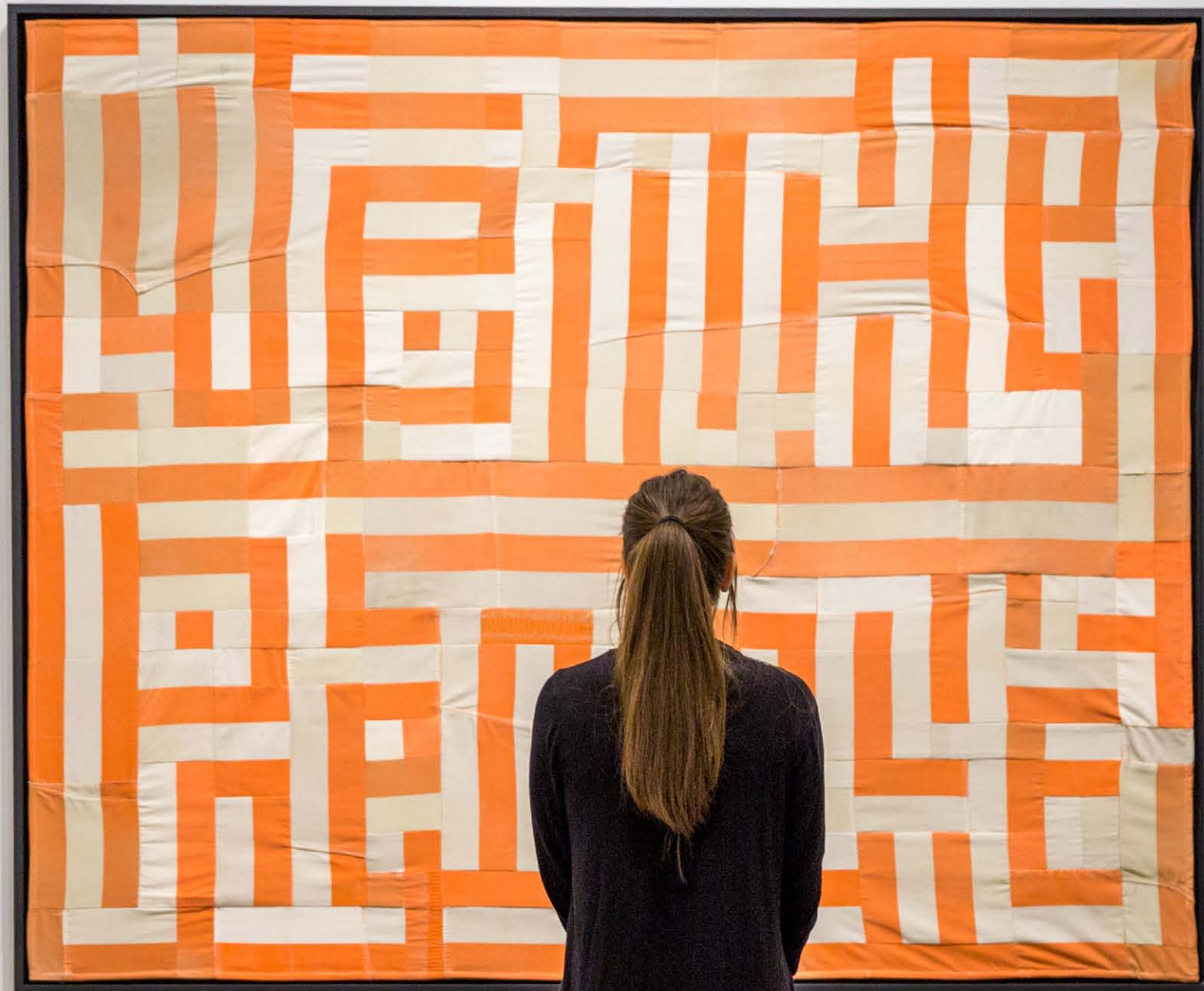
Visitor with Hank Willis Thomas's We The People , 2015, on view in We the People: New Art from the Collection (October 23, 2018–July 21, 2019).