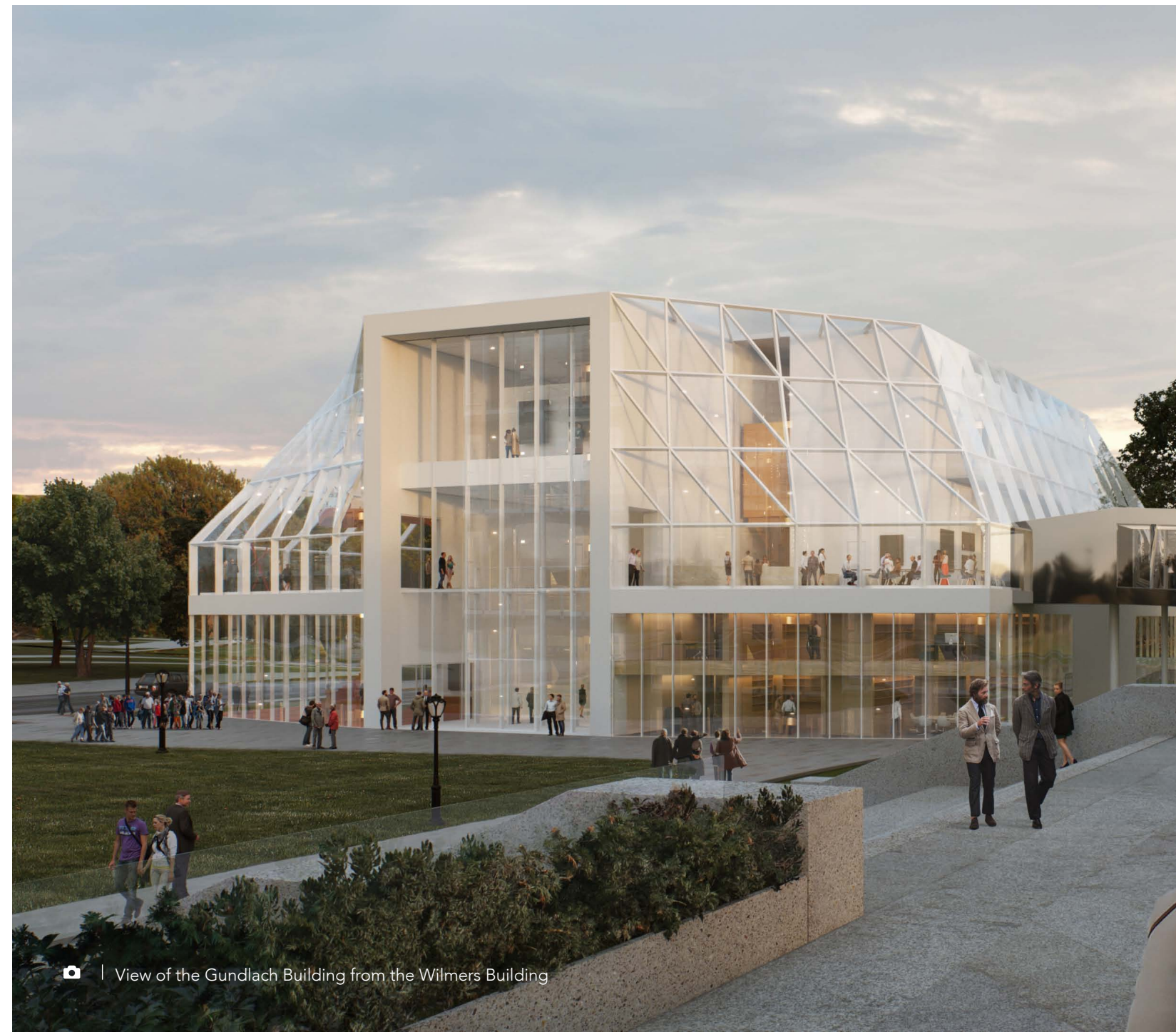
View of the Gundlach Building from the Wilmers Building

The Board of Directors extends deep gratitude to each of the generous donors who have made gifts and pledges to the campaign. Gifts of $1,000 or more are listed here.